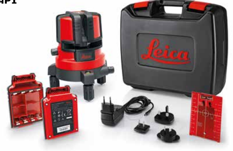
Delivery package Leica Lino L4P1 Art. No: 834838

All descriptions are subject to change without prior notice. Printed in Switzerland. Copyright Leica Geosystems AG, Heerbrugg, Switzerland 2016.