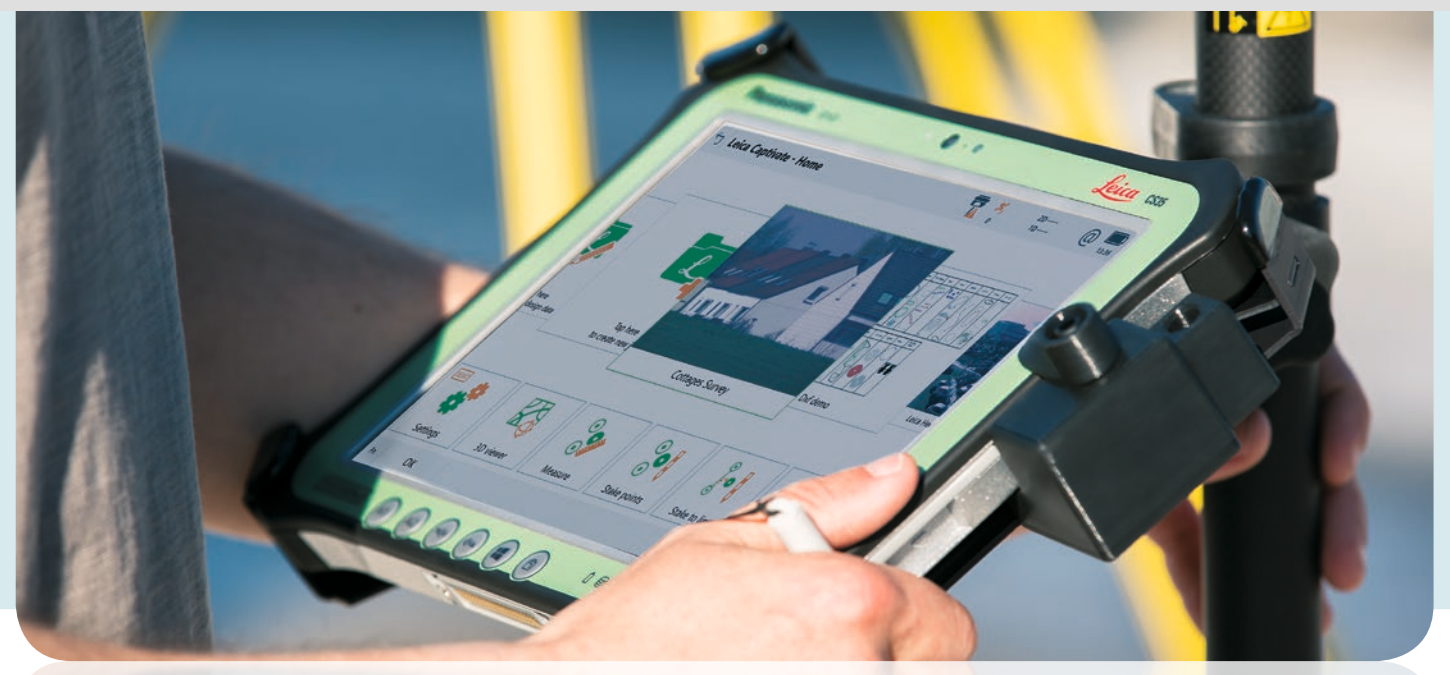
Leica Captivate provides familiar touch technology and easy-to-use apps.

nology to bring about a new experience. The new field software requires a new generation of field controllers and tablets. That is why we developed the Leica CS20 and Leica CS35. With their large displays and high performance, they provide the perfect platform for Leica Captivate. We also thought about the user experience on the total station. We needed to develop a completely new generation of total stations and MultiStation. The Leica Nova MS60, the Nova TS60 and the Viva TS16 are the world's first self-learning MultiStation and total stations, which, thanks to ATRplus, automatically learn the environment around them and adjust accordingly to provide dominant performance. Our focus on the customer experience also runs to our GNSS offering. Thanks to Leica Captivate and the new range of field controllers and field tablets, we have a completely new GNSS offering combining unlimited performance with an enjoyable experience.