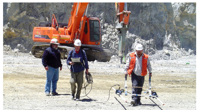
Survey with a low frequency antenna at a mine