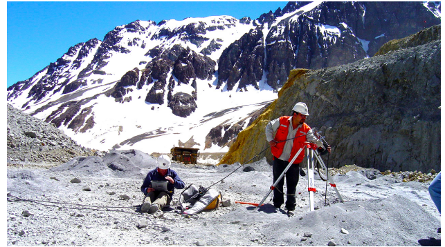
Borehole antenna survey